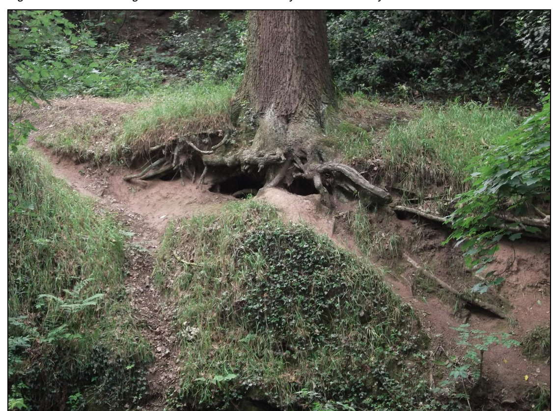
Figure 3.1 – Otter resting site identified within the study area at the Lady Brook.

A single site within the study area was identified which appeared to be a resting site for otters; a burrow which may form a holt under the roots of a tree adjacent to the Lady Brook (Figure 11D.1). This site contained dried grass and leaves that had clearly been dragged in, and the likely function of this material was as bedding for the animal occupying the area. Paths lead to and from the site to the Lady Brook.